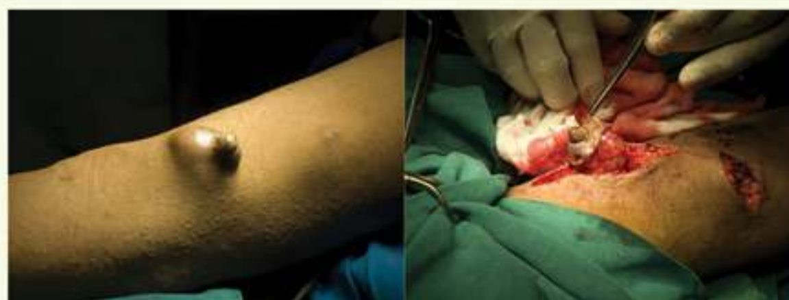
He underwent excision of the aneurysm, ligation of the fistula and creation of a second new fistula in the opposite hand.

Two cases of venous aneurysm formation in dialytic A-V fistulae underwent successful treatment at Omega Hospital recently. Both were true aneurysms on the venous limb of the fistula Patient 1 had as infective aneurysm at the site of repeated puncture (distant from the fistula) for dialysis .